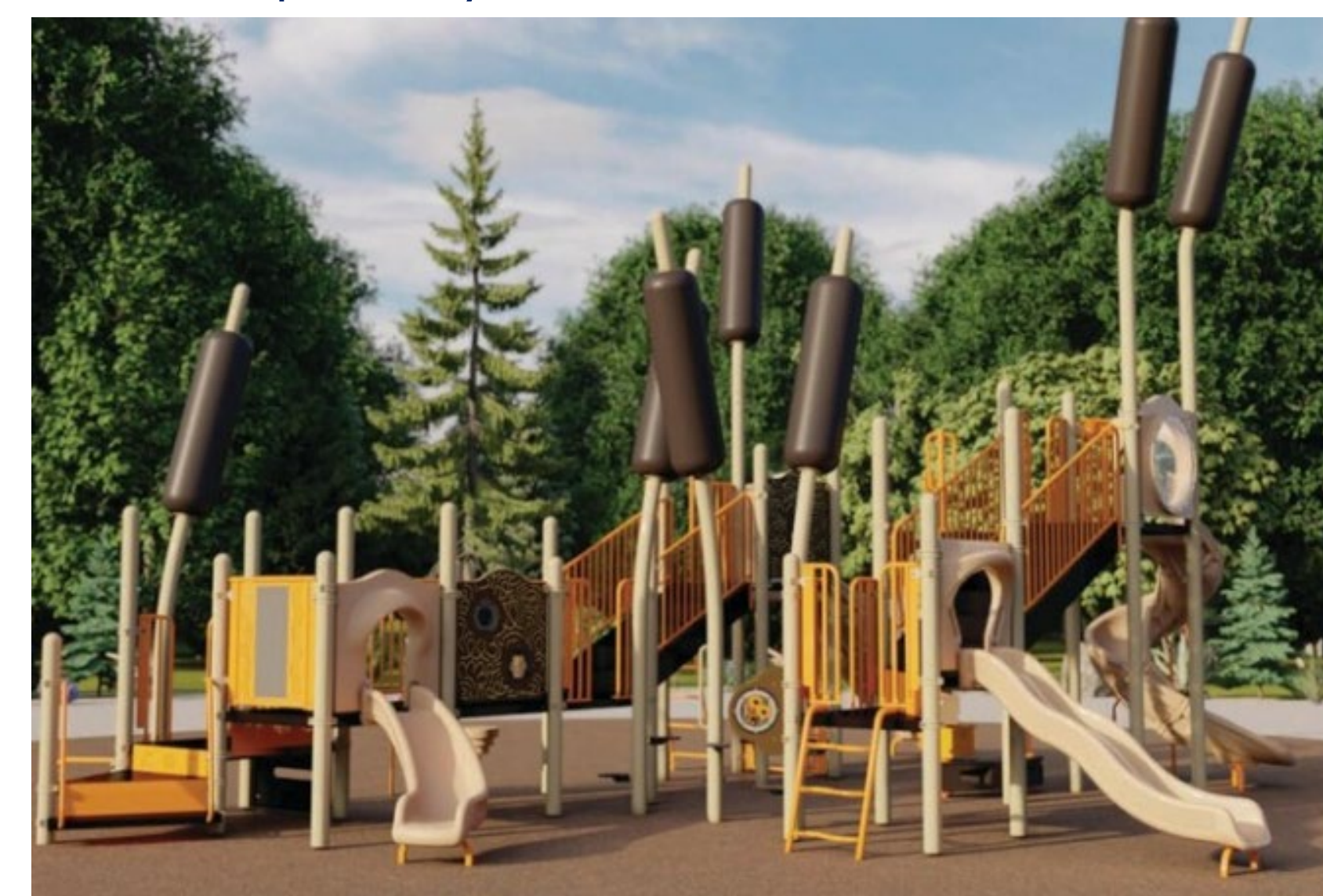
Junior / Senior Play