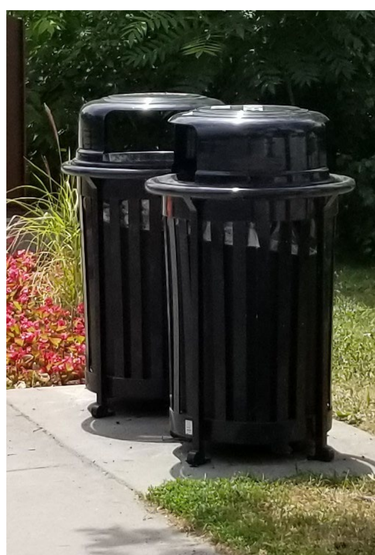
Waste / Recycling